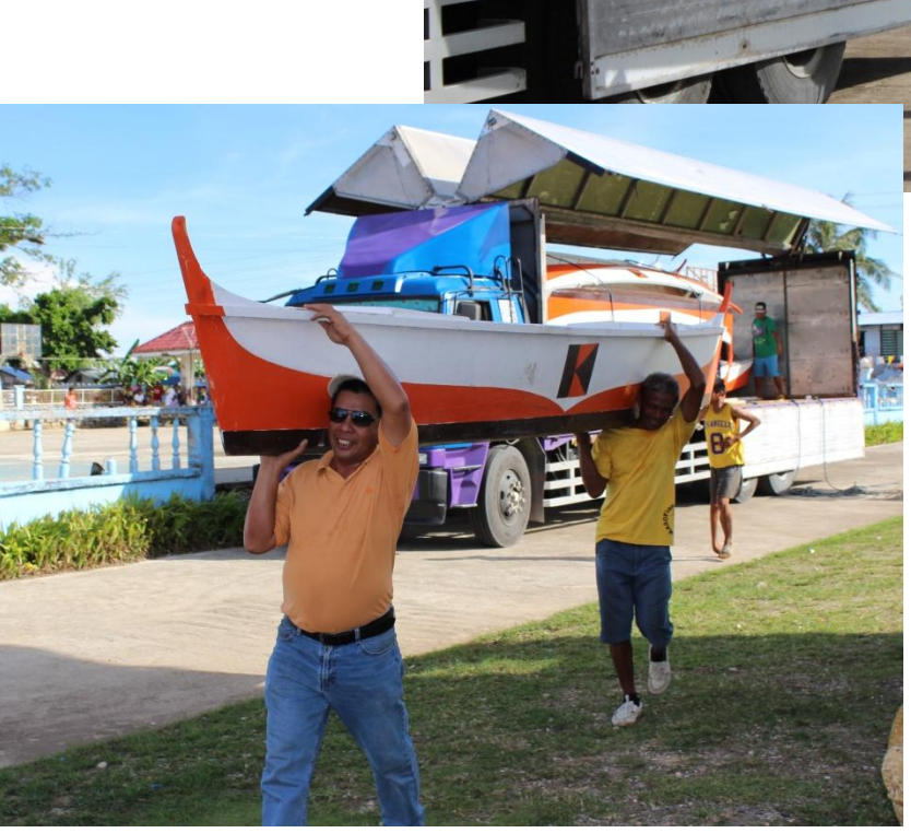
KSPI BOT Vice Chairperson doing his own version of supreme sacrifice by carrying a boat together with a fisherman beneficiary.

KSPI BOT Youth Representative helping out in the unloading of boats.