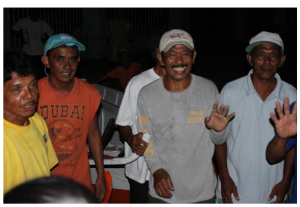
Fishermen expressing their deepest gratitude to IKS and the Archdiocese of Caceres.