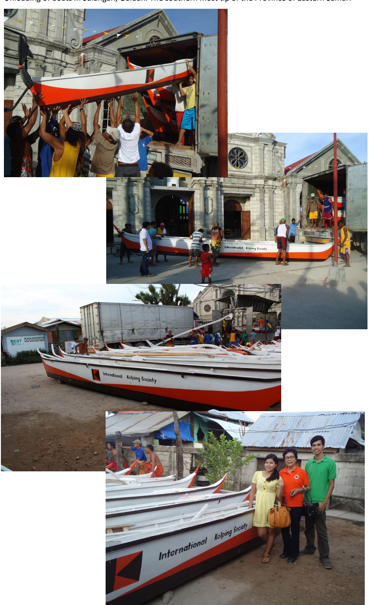
Unloading of boats in Sulangan, Guiuan. The southern most tip of the Province of Eastern Samar.