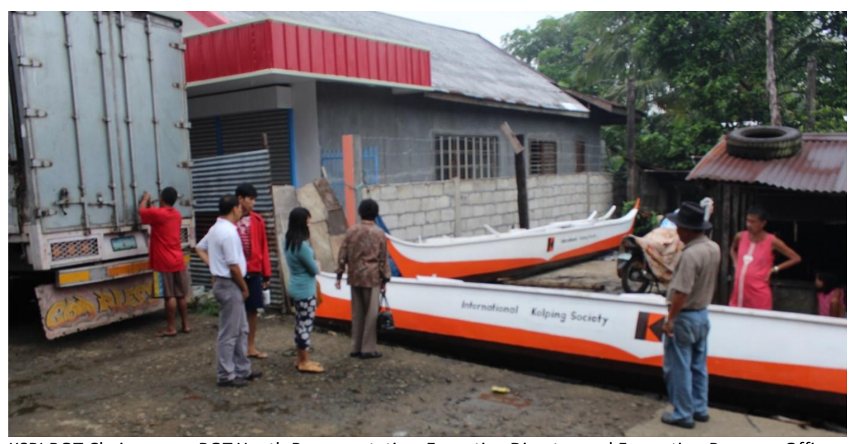
KSPI BOT Chairperson, BOT Youth Representative, Executive Director and Formation Program Officer conducting final inspection before the loading of boats into the 10-wheeler truck.