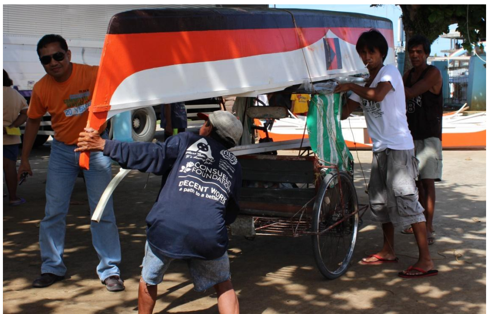
KSPI Executive Director lending a hand to one of the beneficiaries.

Typhoon Haiyan/Yolanda-ravaged church at the background.